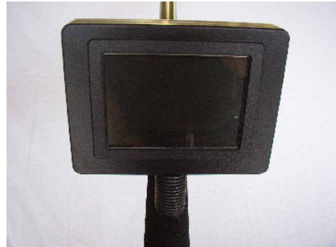
LCD Display w/ 5" Viewable Area Weatherproof enclosure with fully articulating fixed display mount